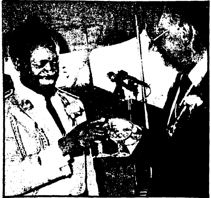
Frontline backstab: Mozambique's nationalist Machel and South African butcher Botha toast Nkomati pact that betrayed anti-apartheid struggle.