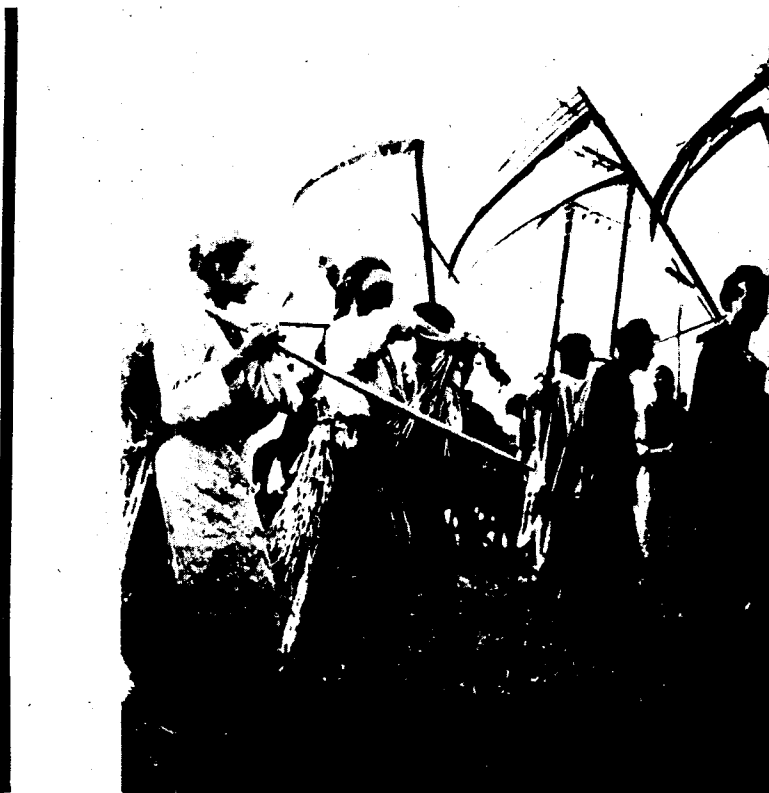
Russian peasants march to the fields in 1920's. is notoriously low. Drive for accumulation means verted. Thus crises, as in Poland, frequently occur

"The following comparison of economic growth and inventories shows clearly the true value of the much-prized 'growth' in the Eastern European countries. From 1971 to 1973, Polish gross national product increased by 334.1 billion zlotys, while inventories in-