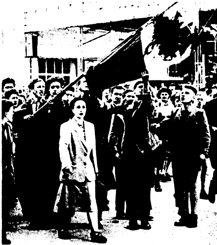
Poznan strike, 1956. Workers march on secret police headquarters under flag drenched in martyrs' blood. Stalinist army killed 53, wounded 300 workers. U.S. Communist Party scum say such "differences," which regularly erupt in Poland, "occur even in loving families."

Party head brought in, Edward Gierk. In January 1971 Gierk was compelled to visit Szczecin to meet with the workers' delegates demanding withdrawal of price hikes; this event became widely known when workers recorded it and transcribed the hours-long discussion. Gierk did persuade the workers to return to work, but the discussion revealed the various layers of political consciousness among the workers and forced promises out of the authorities. Prices were finally brought down when textile workers in the industrial center of Lodz went out, threatening to spread the strike wave throughout the country.