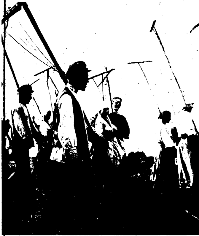
Under Stalinist state capitalism, farm productivity that consumer goods investment is inevitably deliver food shortages and high prices.

The enormous stockpiling of unusable goods, frequently unfinished and of low quality, shows the fictitious character of much of the growth that took place under Stalinism. It reflects the Marxist law that under capitalism in its epoch of decay, the value-form of production is a brake upon the organic development of the means of production and therefore of useful goods. In the bureaucratically run economies, the relative lack of competition permits even greater obsolete capital and fictitious valuation than otherwise. The inconvertibility and black-market trading of the Russian and Eastern European currencies is a striking indication of this fiction. Zwass' conclusion that the enormous waste wipes out