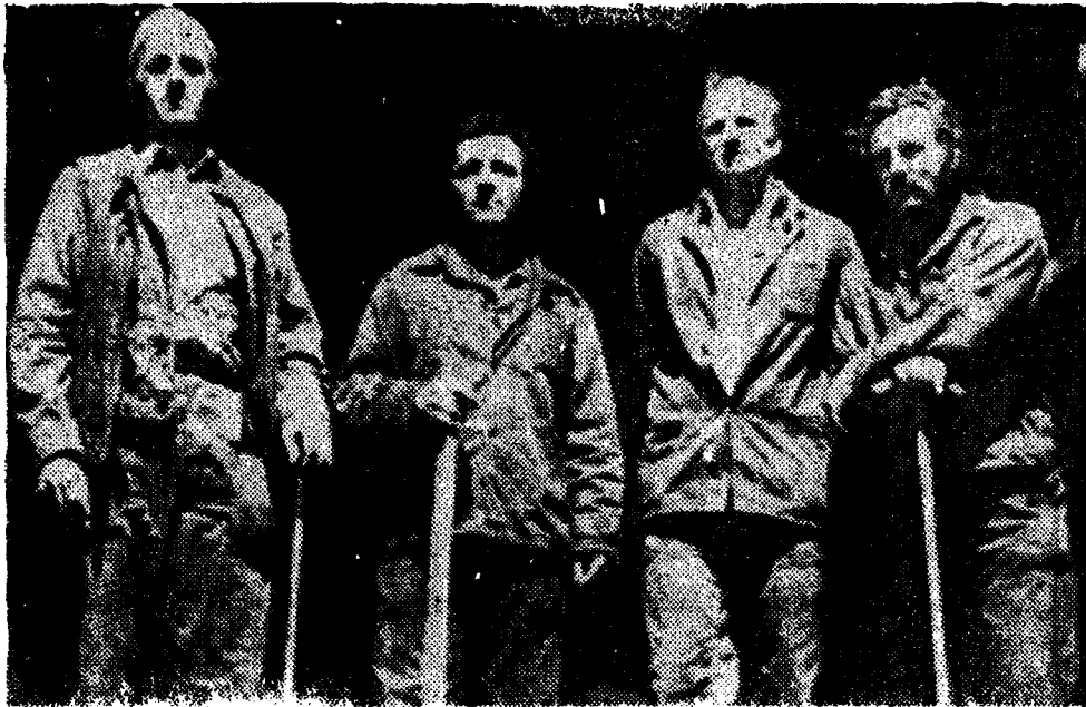
Striking workers, armed with clubs, guard the Lenin Shipyard in Gdansk. The ruling class is waiting for the workers' guard to go down before it launches its counter-attack. Workers will soon need more than clubs.

This sort of venom is what we imagine the financial editors say privately when they are done prating about the Polish workers' heroism. It is also what their counterparts in the Stalinist planning bureaus sneer under their breath, the distilled essence of bourgeois economic wisdom, freed from cant: "Let the workers pay" and "All these shiftless bums want is a free ride." Significantly, in criticizing the workers in this passage, the Spartacists support the petty-bourgeois dissidents