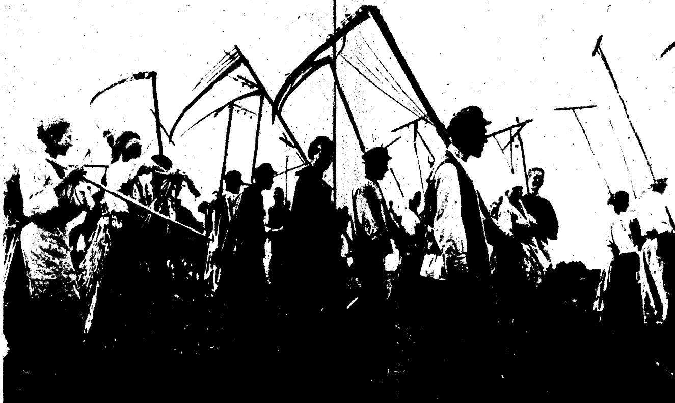
Russian peasants march to the fields in 1920's. Under Stalinist state capitalism, farm productivity is notoriously low. Drive for accumulation means that consumer goods investment is inevitably diverted. Thus crises, as in Poland, frequently occur over food shortages and high prices.

The enormous stockpiling of unusable goods, frequently unfinished and of low quality, shows the fictitious character of much of the growth that took place under Stalinism. It reflects the Marxist law that under capitalism in its epoch of decay, the value-form of production is a brake upon the organic development of the means of production and therefore of useful goods. In the bureaucratically run economies, the relative lack of competition permits even greater obsolete capital and fictitious valuation than otherwise. The inconvertibility and black-market trading of the Russian and Eastern European currencies is a striking indication of this fiction. Zwass' conclusion that the enormous waste wipes out