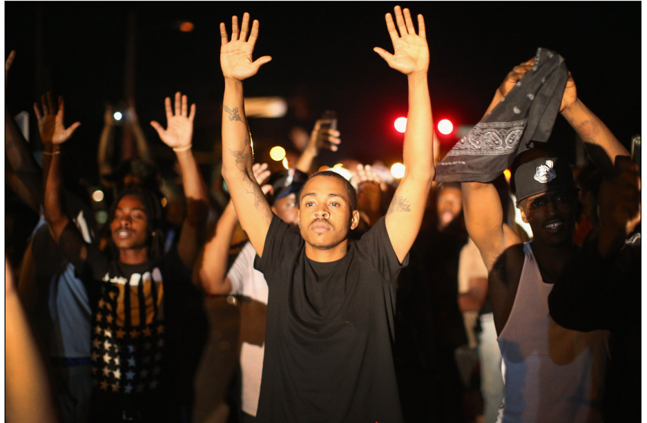
Ferguson protesters with arms raised. Michael Brown was shot with his hands up.

Other leaks aimed at encouraging sympathy for the killer cop have emerged. Among the latest is that Brown had marijuana in his system. Since marijuana has no connection to violent behavior and has been consumed at one time or another by almost half the population, this "fact" only speaks to the repressive nature of marijuana laws and their targeting of young Black and Latino men. Such leaks