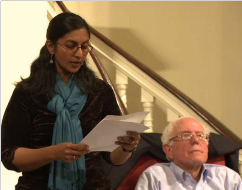
New York, September 2014. Kshama Sawant calls on stealth Democrat Bernie Sanders to run for president.

ment demanding a $15 minimum hourly wage, since the Green Party is purely an electoral machine with no real membership structure, the Hawkins/Jones campaign could offer only an electoralist perspective of winning progressive gains through voting.