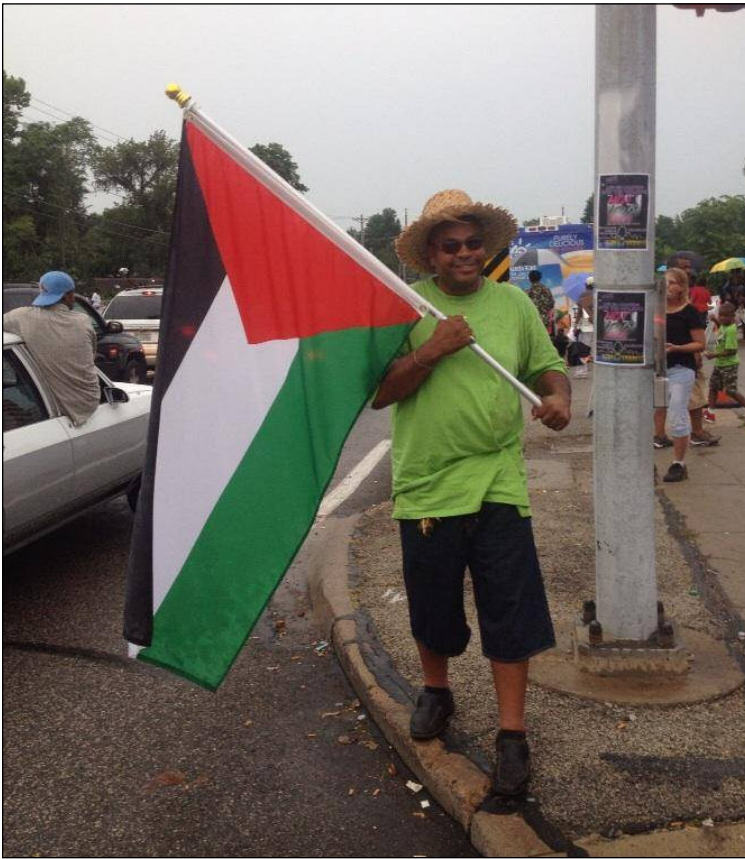
Demonstrator waving Palestinian flag in Ferguson shows mutual solidarity with Gaza resistance.

grants first and foremost but is also used to suppress the working and living conditions of the whole working class as well as of ever-larger sections of the middle class. Racism is part of the essence of capitalist society.